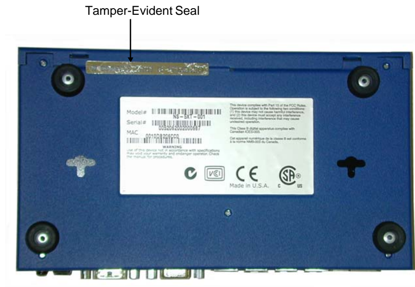
Figure 2 Tamper-Evident Seal